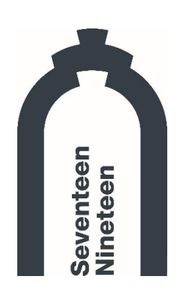
Form EOI/CCT/24 - Expression of Interest