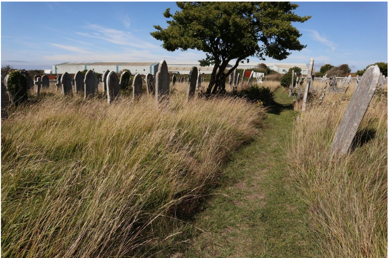
View of the churchyard 23 rd August 2019 dominated by long grass over most of the area except for mown footpaths.