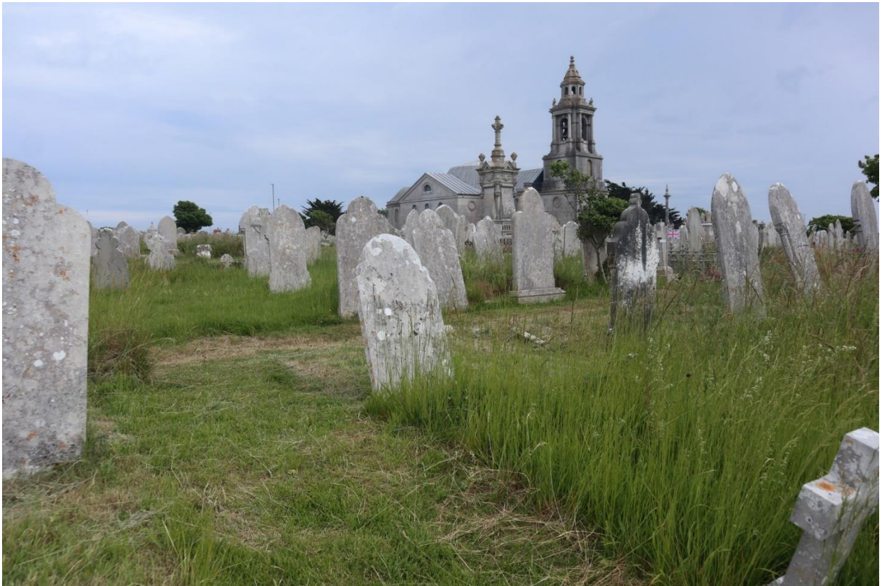
A general view across the churchyard

On the second visit we were very pleased to see the extent of grass cutting to create 3 different grass lengths. Many native plants were in flower and being visited by insects such as Marble white butterflies. Examples of some these are shown below.