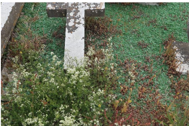
Tomb with Biting stonecrop