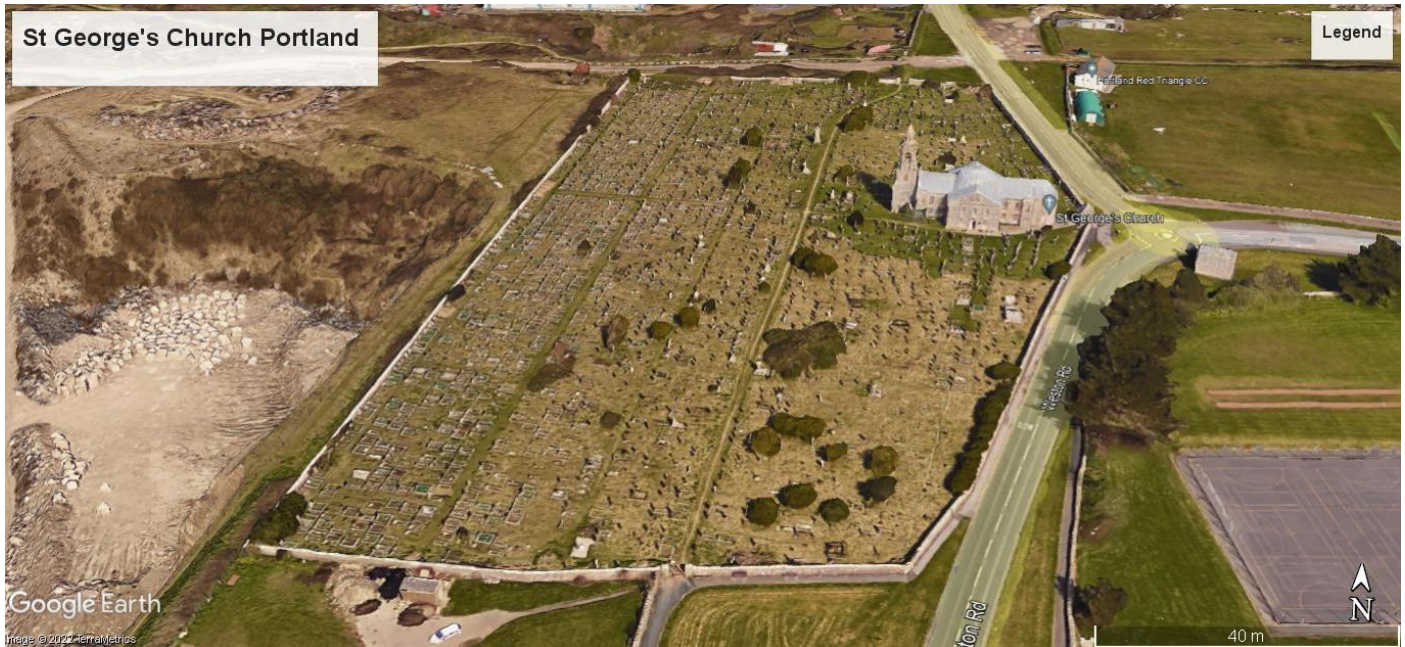
Google Earth aerial view of the church and churchyard showing the extent of the large churchyard adjacent to the large working quarry