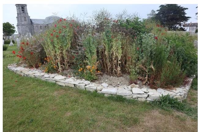
A walled border in flower.