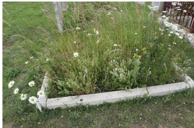
Tomb with many wildflowers